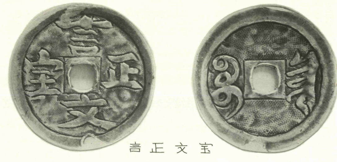
The reading of the obverse inscription given here is a fairly characteristic amuletic form, but it is not the only possible reading for this inscription. The character Wen can also be translated Cash and the character Bao also means Currency; so one could read 'The Speech of Righteous Cash Currency': 'Speak forth, the Cash of Just Currency'; or various other permutations on this theme. The mint name on the reverse appears to be intentionally fictitious, as on other specimens catalogued below. Although the closest reading is Chuan, indicating the Peking Board of Revenue mint, the character Chuan seems to have been engraved incorrectly on purpose (lower part malformed).